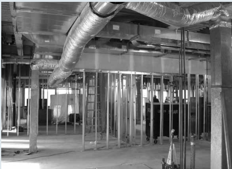
The new OR currently under construction will feature six operating rooms with leading-edge technology.

Work at the Sussex campus continues and involves some upgrades in the operating room, renovating outpatient space to establish a Women's Center and exterior upgrades to the grounds. The exterior work and landscaping has been substantially completed.