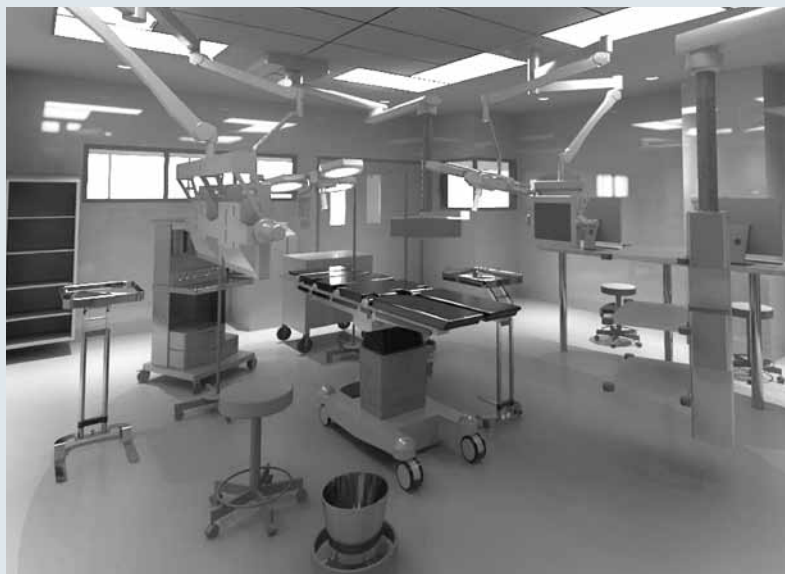
A 3-D image of what a completed operating room will look like.